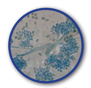
AIRBORNE MOLD SPORES Reduced 99.5% by iWave purification as tested by Green Clean Air