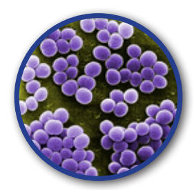
STAPH Reduced 96.24% after 30 minutes of iWave purification